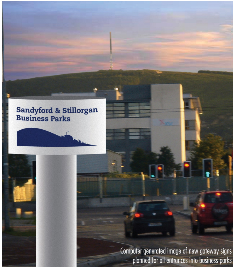
Computer generated image of new gateway signs planned for all entrances into business parks